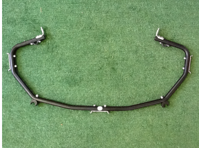
Open Crossframe 4S